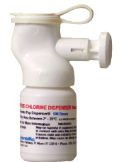
PPD-2 DPD Free Chlorine Dispenser

The HF PPD-2 DPD Dispenser is compatible with HF and many non-HF scientific photometers.