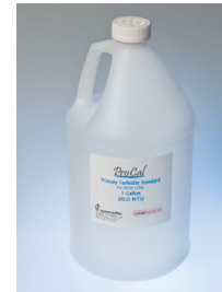
ProCal gallon for Hach® 1720

Standards certified* for use with the Hach® Company's 1720 series turbidimeters