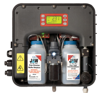
CLX Instrument cover removed

Hach® is a registered trademark of the Hach® Company, which is not affiliated with HF scientific.