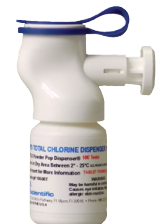
PPD-2 DPD Total Chlorine Dispenser