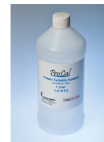
ProCal liter for Hach® 1720