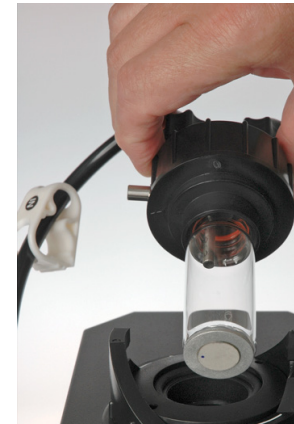
Ultrasonic autoclean system

*Contact HF scientific customer service for more information toll free: 888-203-7248